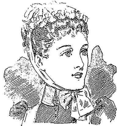
Garrould's New " Sister Mabel " Cap (as per sketch). Made of fluted washing cambric with French frill edging, 1 6 each, by post 1 9.

Telegraphic Address: "GARROULD, LONDON."